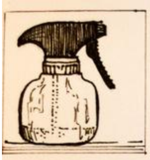
One full drawing of the object.