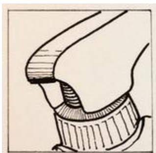
Using the viewfinder helps create an interesting composition where the object goes off the edges of the paper.