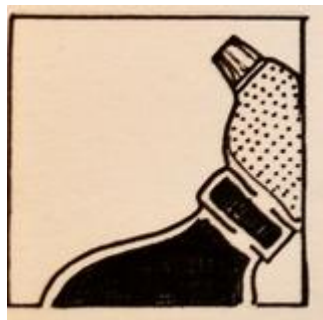
One viewfinder view with either the positive or negative space having a solid fill of gray or black.